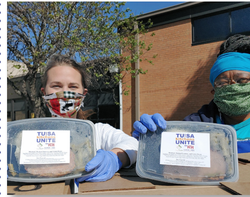
April 2020 - Volunteers served free meals to Tulsa-area families through the Tulsa Kitchens Unite program

360,000 MEALS DISTRIBUTED in 12 weeks through Tulsa Kitchens Unite