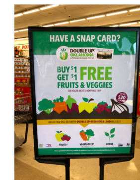
November 2020 - Poster advertised DUO at Okemah's Homeland grocery store

The Double Up Oklahoma (DUO) grocery store pilot in Okemah, Oklahoma is making an immediate and systemic impact. In November and December 2020, participants redeemed about $3,000/week in DUO benefits – equal to over 3,000 lbs. of apples and