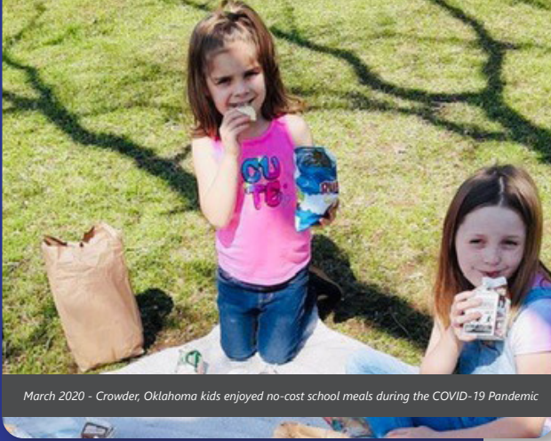
March 2020 - Crowder, Oklahoma kids enjoyed no-cost school meals during the COVID-19 Pandemic