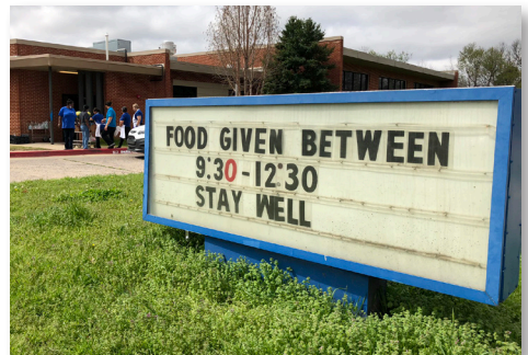
March 2020 - Kaiser Elementary's marquee advertising school meal pick ups for Oklahoma City-area families

Bringing back over $2.1M in benefits to Oklahoma for families in-need.