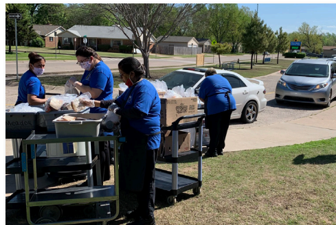
April 2020 - Child nutrition staff distributed no-cost school meals to Oklahoma families

Having Hunger Free Oklahoma to turn to was critical at the beginning of the COVID-19 pandemic. The information HFO provided allowed me to guide my Clubs when they were needed to serve thousands of meals a day to children who could not get their regular meals at schools. This work made the difference between children eating or children going hungry because Clubs were able to start serving food as soon as possible. I am so grateful for HFO's knowledge and support of our feeding programs.